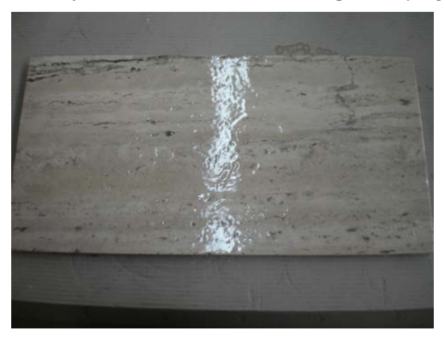
NOTE: the picture above shows an application of JOLLY - GLASS on travertine slab; see how pores keep perfectly visible. After polishing the results are surprising; the mastic remains transparent even in case of very thick coats.

Do not apply on wet or humid surfaces in order to avoid incomplete drying process.